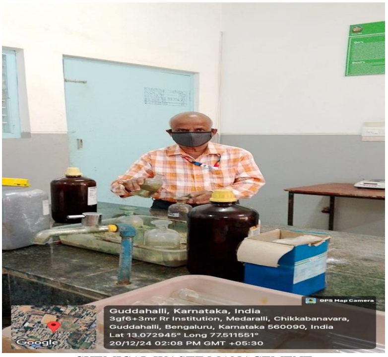
CHEMICAL WASTE MANAGEMENT