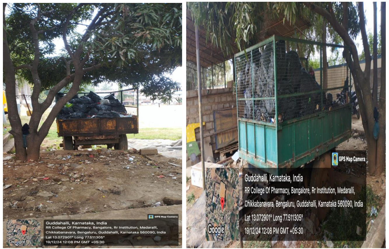
SOLID WASTE MANAGEMENT